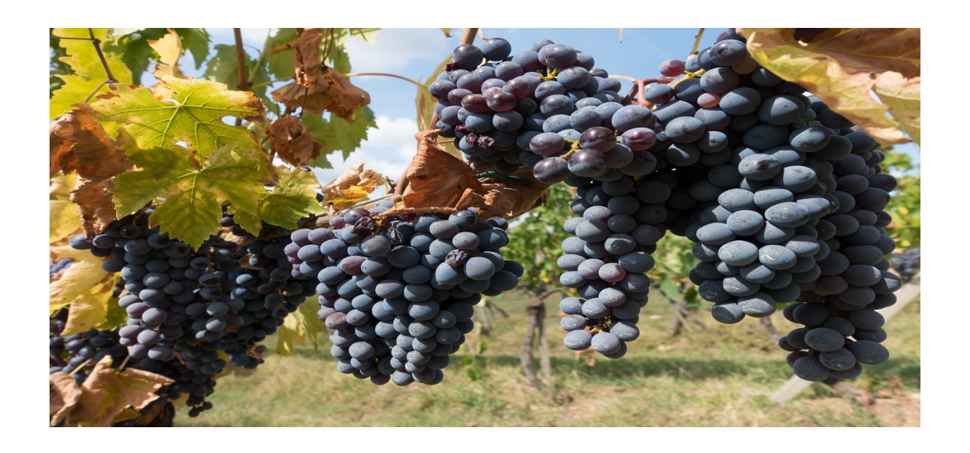
Day 7 - Departure

Choose to be driven to Florence or Pisa Airport or extend your stay with a few more days in Florence to further experience the wonders of this captivating city.